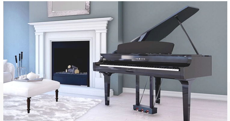
The Clavinova Digital Piano

Recently our sanctuary piano has developed some mechanical issues which are not fixable. In evaluating replacement options, a digital piano has been determined to best fit the current and future needs for musical expression. Session has approved the purchase of a new piano for the sanctuary using the Cook Mission/Youth/Music Memorial Fund.